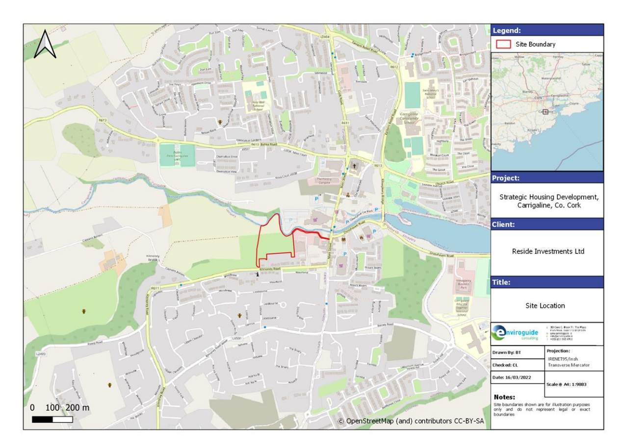
Figure 2-1: Site Location Map